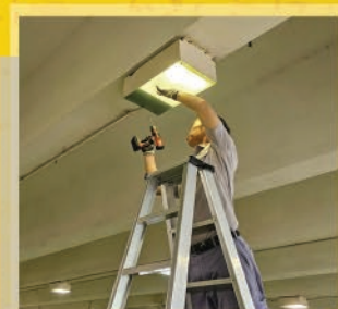
Replacing light tubes at Indoor Green 更換室內草地滾球場光管