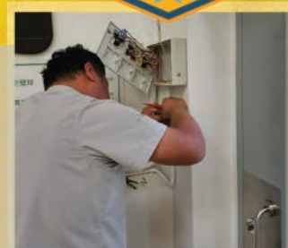
Fixing electrical installation 維修電力裝置