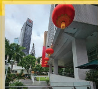
Hanging big lantern lights 懸掛大燈籠