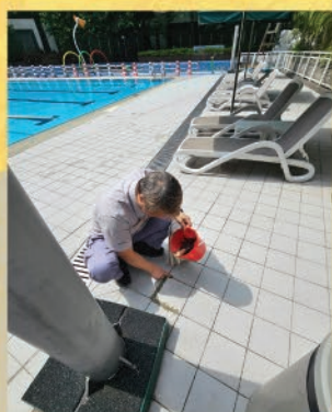
Repairing de-bonded pool deck tiles 修繕游泳池邊鬆脫瓦片