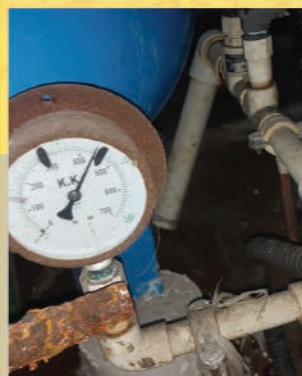
Fixing defective flushing water control valves 維修沖水制閘門