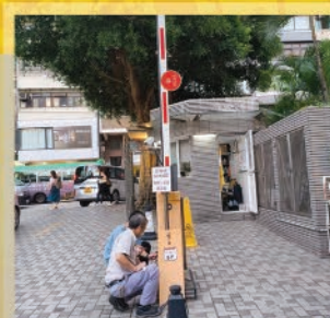
Repairing drop bar 維修電動閘杆