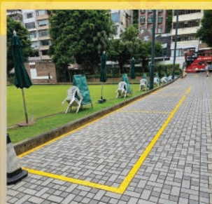
Painting line-marking for parking lots 車位油線