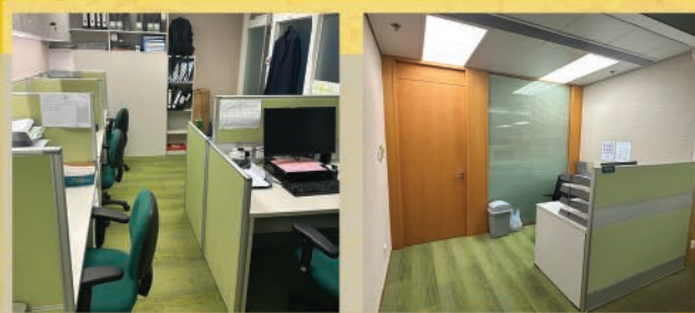
Office renovation works 寫字樓改善工程

我們的室外草地滾球場向來是本會的重點運動設施之一，得到園丁的悉心照顧，堪稱全港最佳的滾球場之一。然而，由於照明系統老化及供電不穩定，照明燈持續出現故障。為解決這些問題，並履行我們在 ESG 的改善工作，我們決定安裝一套全新的系統，採用節能的LED照明系統代替傳統的照明燈。當會員看到本期通訊時，整個照明工程亦應該已經完成。